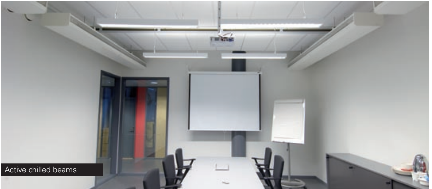
Active chilled beams