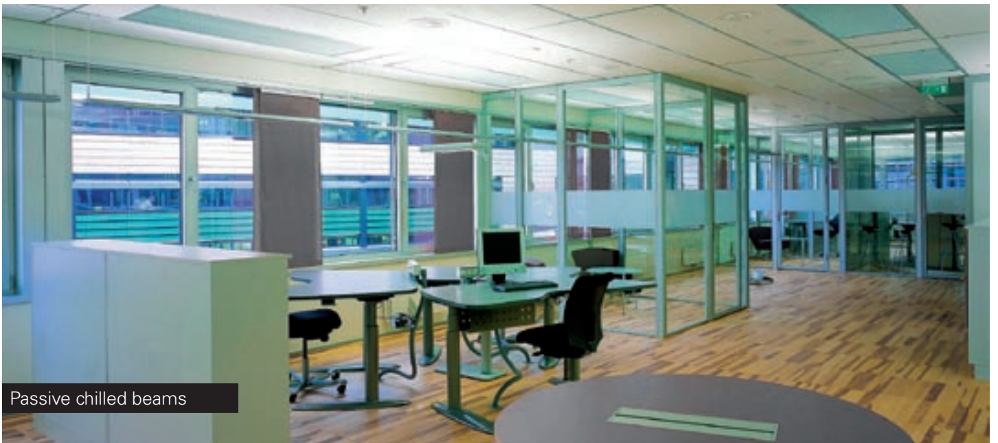
Passive chilled beams