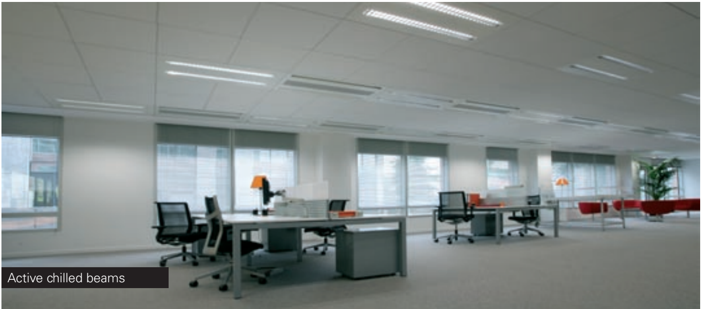
Active chilled beams