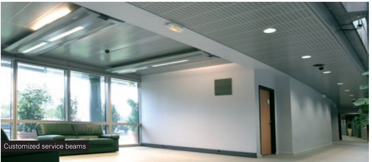
Customized service beams